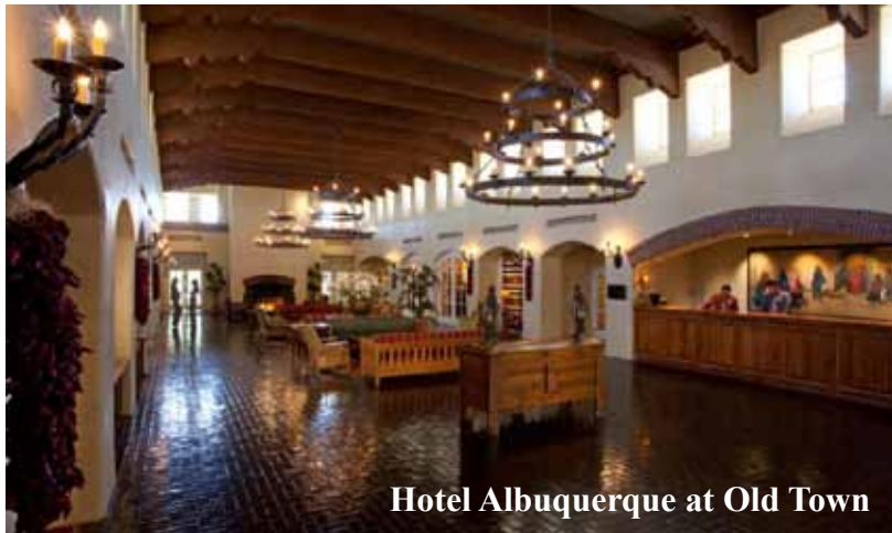
Hotel Albuquerque at Old Town

Attend this premier event and get the latest information on upcoming acquisitions! •