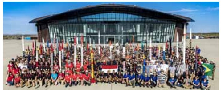
2017 Spaceport America Cup Participants

PACA is sponsoring the Spaceport America Cup this year for the first time. It is the world's largest intercollegiate rocket engineering conference and competition to be held June 19-23 at the Las Cruces Convention Center and the Spaceport America Vertical Launch Area. Hundreds of universities from across the globe will participate in this competition where 10-50 foot tall experimental rockets launch to altitudes of 30,000 feet. Over 110 teams representing colleges and universities from eleven countries participated in last year's event. This is a great way to meet hundreds of talented STEM students and potential job candidates for your companies.