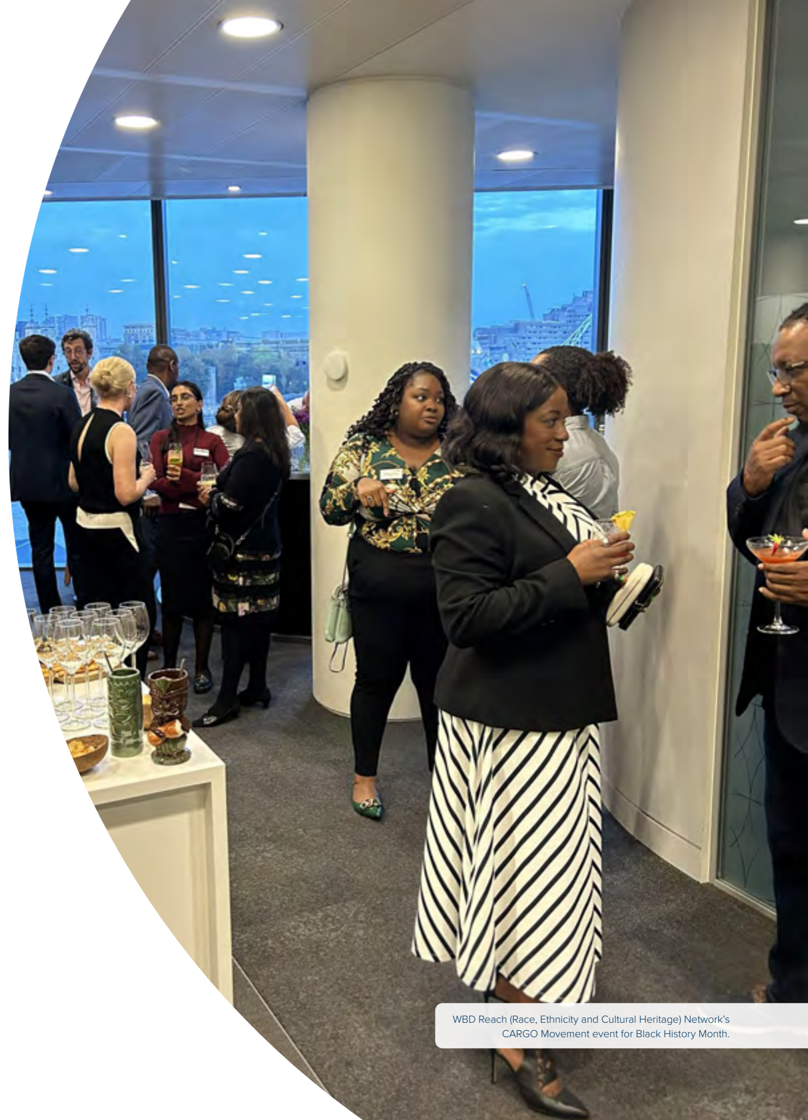
WBD Reach (Race, Ethnicity and Cultural Heritage) Network's CARGO Movement event for Black History Month.