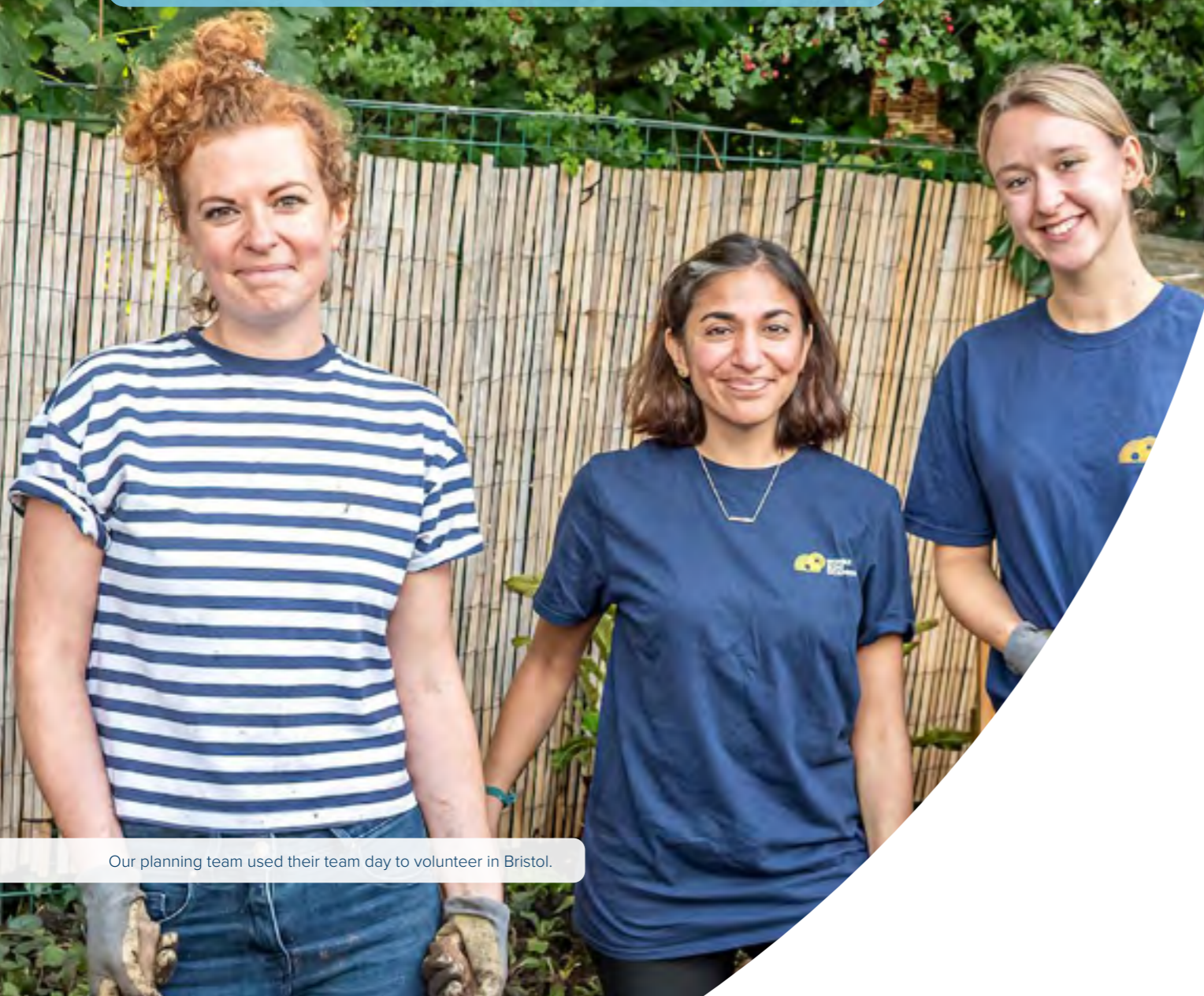
Our planning team used their team day to volunteer in Bristol.

Making a tangible difference in our communities