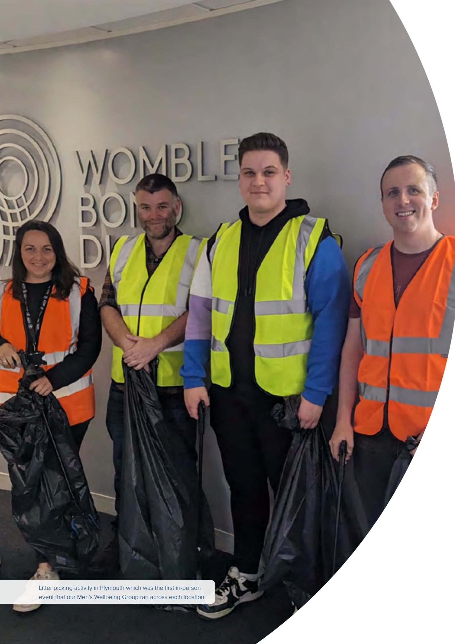
Litter picking activity in Plymouth which was the first in-person event that our Men's Wellbeing Group ran across each location.