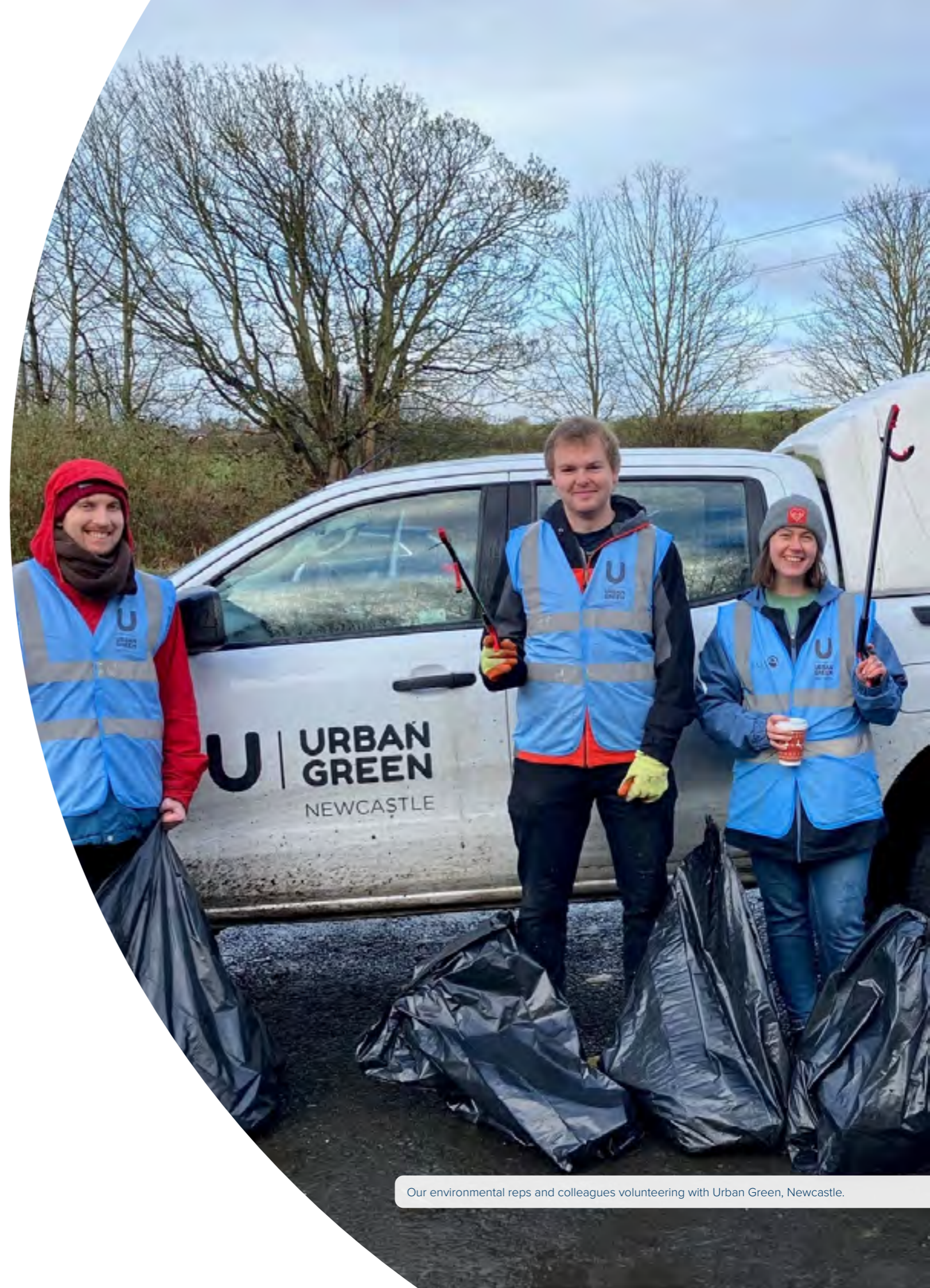
Our environmental reps and colleagues volunteering with Urban Green, Newcastle.