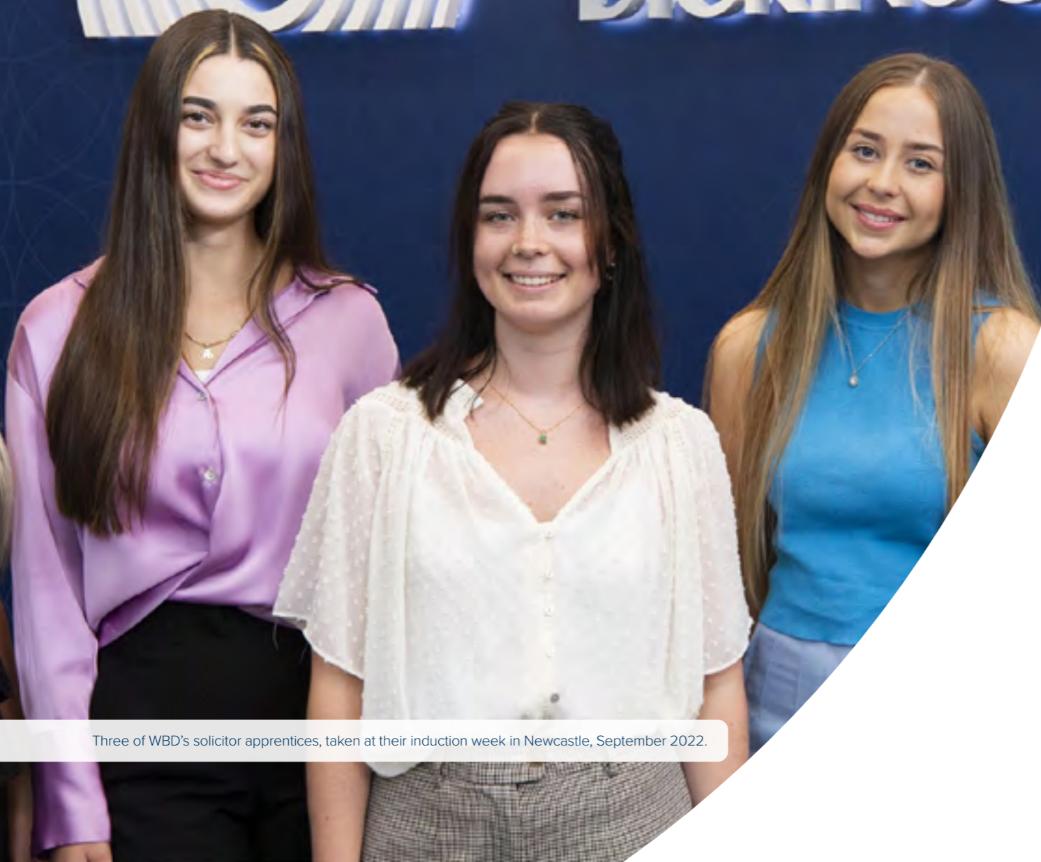
Three of WBD's solicitor apprentices, taken at their induction week in Newcastle, September 2022.

Inspiring young people to unlock their potential