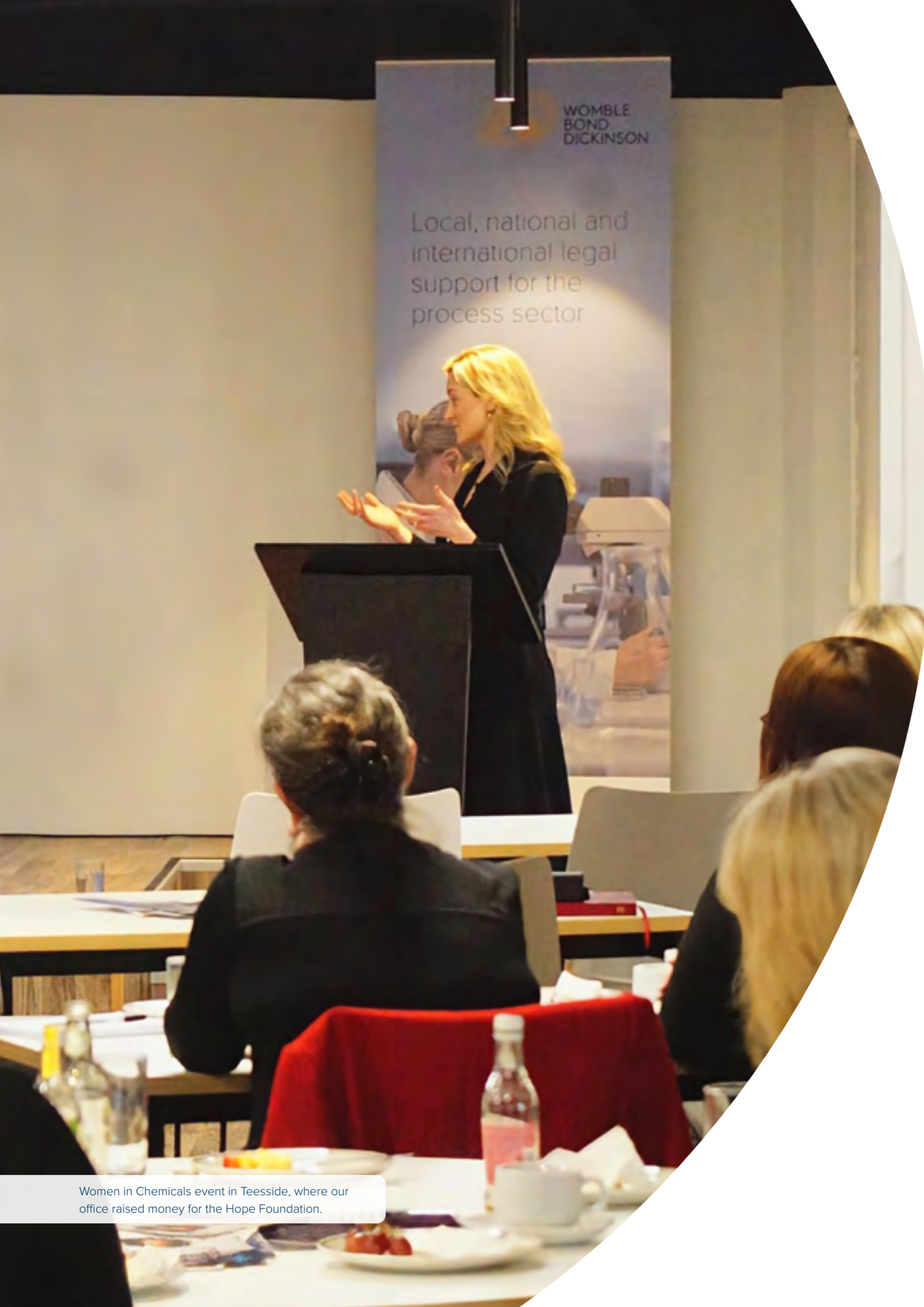
Women in Chemicals event in Teesside, where our office raised money for the Hope Foundation.