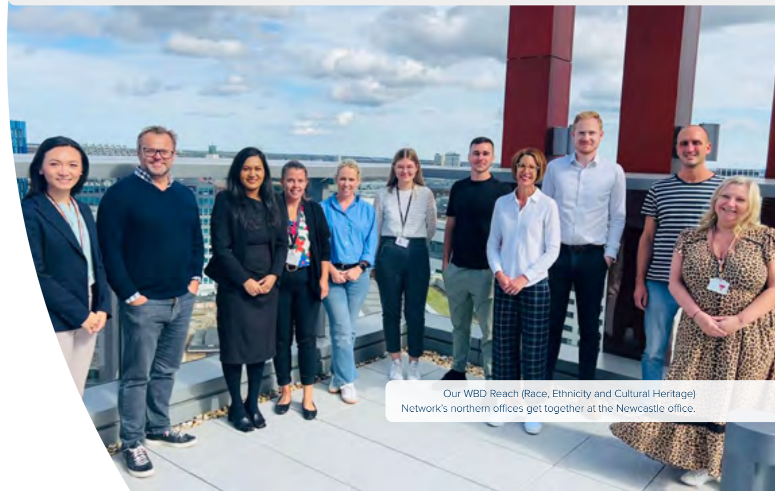
Our WBD Reach (Race, Ethnicity and Cultural Heritage) Network's northern offices get together at the Newcastle office.