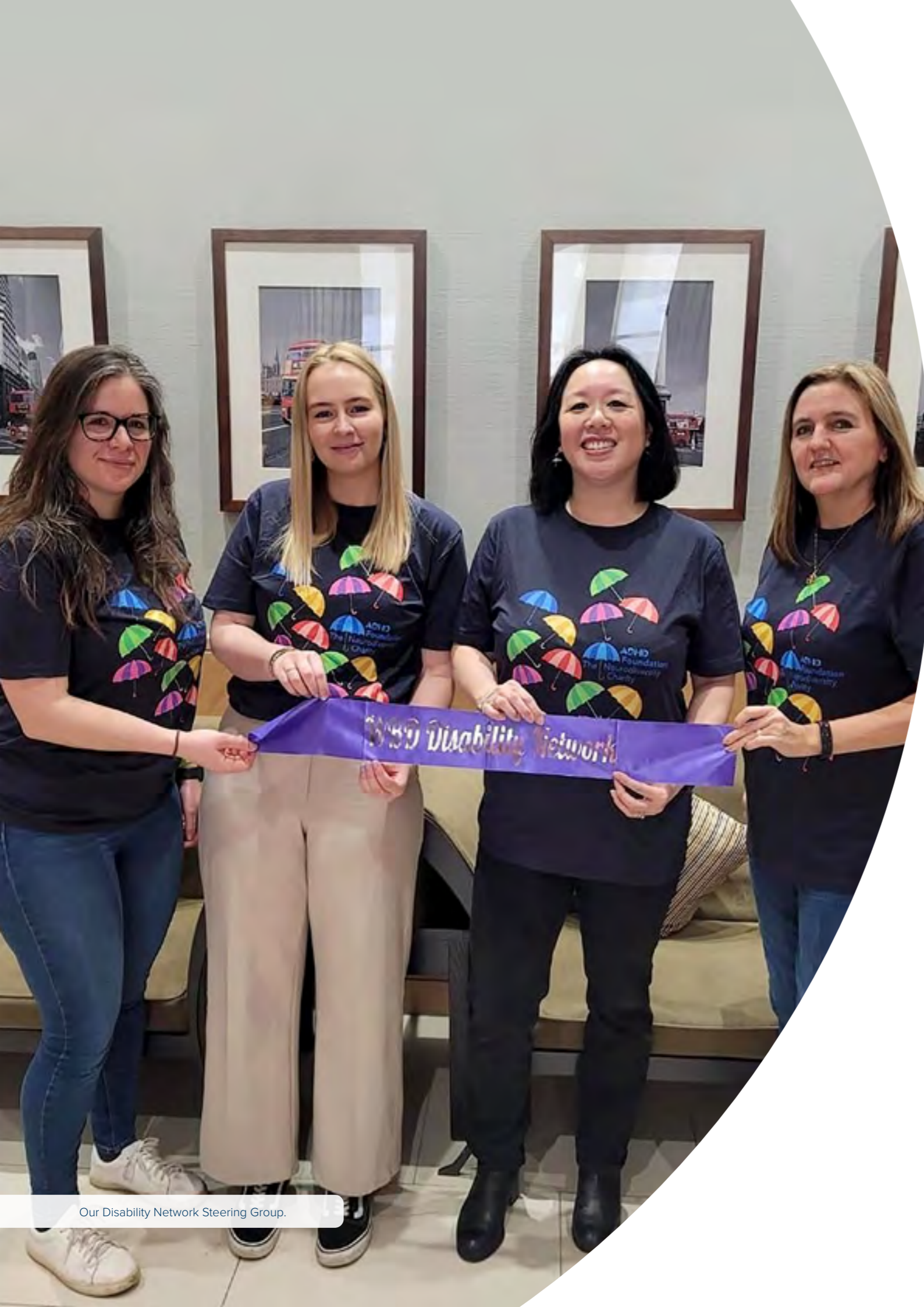
Our Disability Network Steering Group.