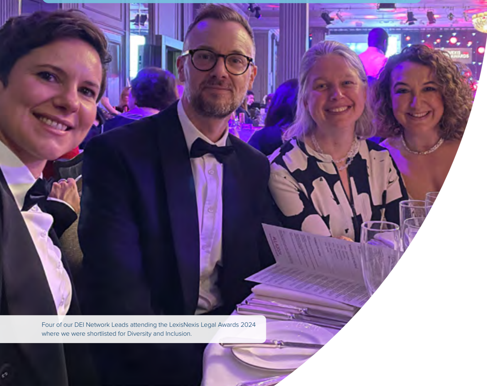
Four of our DEI Network Leads attending the LexisNexis Legal Awards 2024 where we were shortlisted for Diversity and Inclusion.